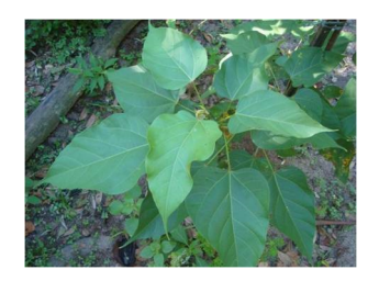
Figure 2. Leaves of Bixa orellana .

inflammations, arterial hypertension, high cholesterol and obesity (Ins, 2010). The veterinary ethnomedicinal use of the species in Trinidad and Tobago is also reported, specifically for the treatment of demodetic mange and other skin parasitism in dogs (Lans et al., 2000).