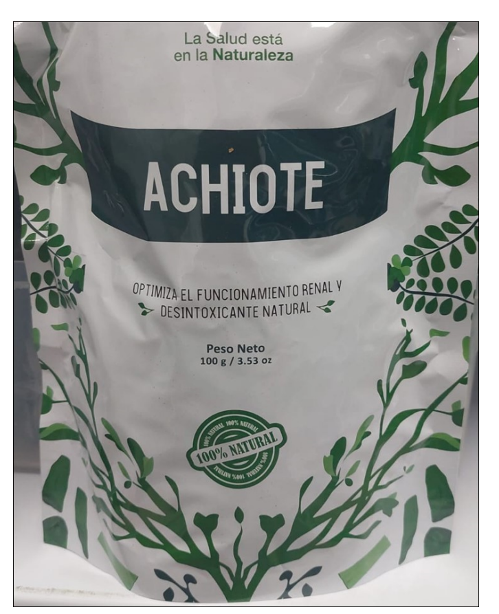
Figure 3. Example of product for infusion based on Bixa orellana "Achiote" leaves marketed in Peru.